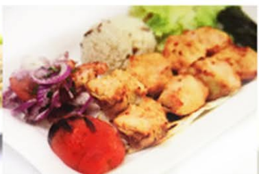
Chicken Shish Kebab