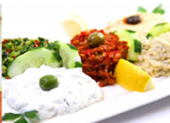
Mixed Appetizer Plate