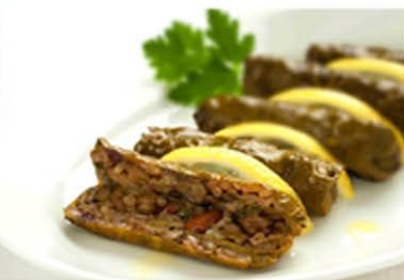
Stuffed Grape Leaves