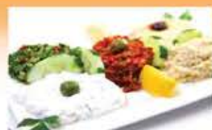
Mixed Appetizer Plate