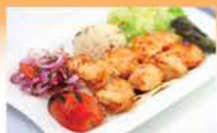
Chicken Shish Kebab